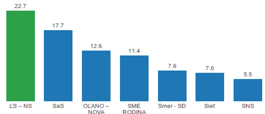
Scheme 1: Young voters' share of popular votes to political parties in 2016