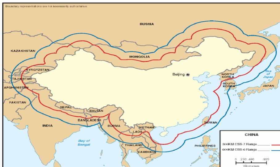
Figure 1. Maximum Ranges for China's Conventional SRBM Force.

Note: China currently is capable of deploying ballistic missile forces to support a variety of regional contingencies.